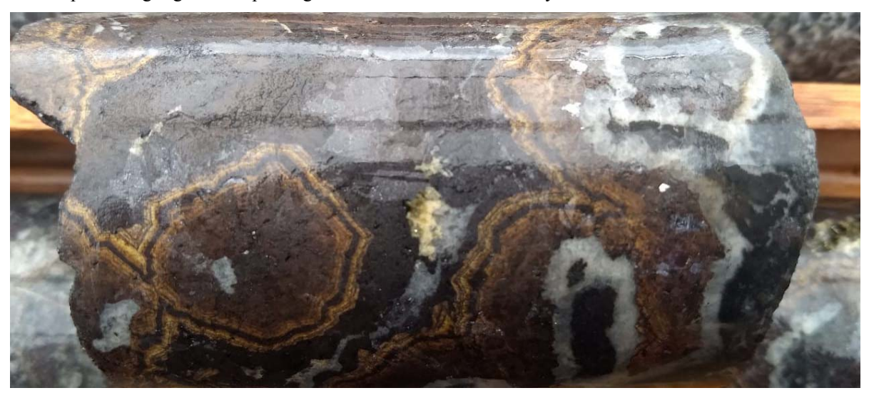
Figure 3. Detailed photo of zinc sulphide textures (see arrow above): iron rich sphalerite or marmatite (purple) with bands of later low iron sphalerite (brown and yellow) and quartz (white). The banding of the zinc sulphides highlights multiple stages of zinc mineralization at Ayawilca.

Note: The photos shown in Figures 2 and 3 are of selected intervals and not necessarily indicative of mineralization hosted on the property.