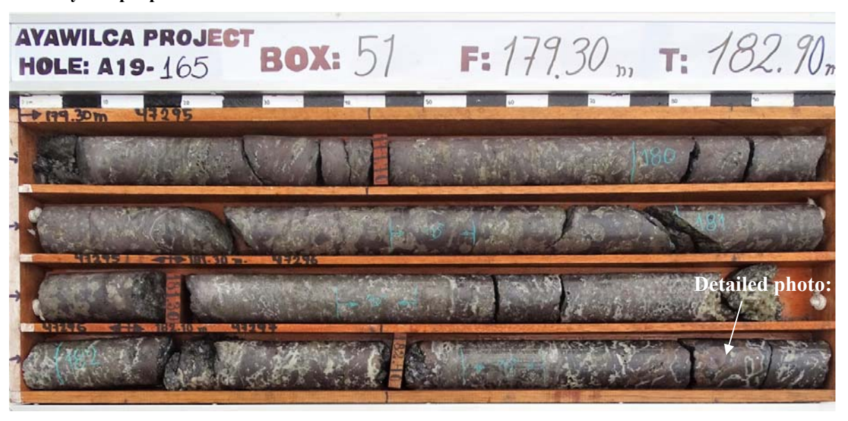
Figure 2. Drill core photographs from the interval in A19-165 grading 18.9% zinc, 42 g/t silver, 0.5% lead, & 584 g/t indium over 7 metres from 178.4 metres. Various phases of zinc sulphides are noted by red-purple-brown hues.

Details of assay intervals within the core photo above: